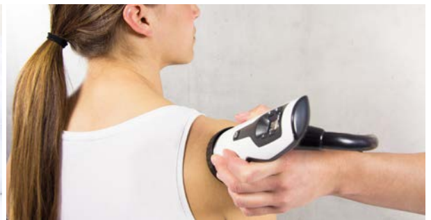
Periarticular shoulder pain