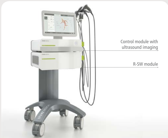
Control module with ultrasound imaging